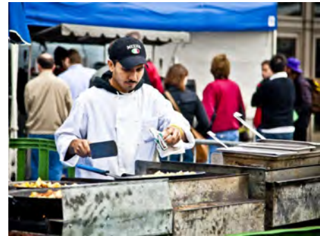
Farmers market vendors may be uncertified or untrained in food processing and food safety concepts, and in most states, farmers market vendors and their food products may not be inspected by local, state or federal public health inspectors.

The research was funded by Penn State Experiment Station and the U.S. Department of Agriculture's National Institute of Food and Agriculture. Full Article... ( Penn State News )